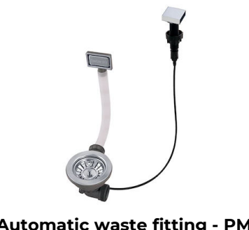
Automatic waste fitting - PM 8407 113